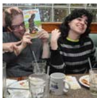
Norwalk STARS Celebrate With Pizza