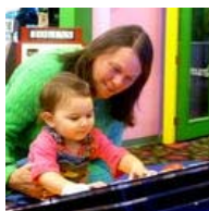
Stamford Bank Honors Norwalk Man's Memory