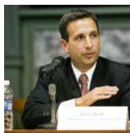
Norwalk Lawmakers To Receive Beacon Awards