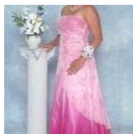
Help a Fairfield County Girl, Donate a Prom Dress